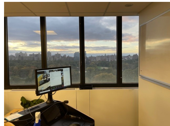
The view from the classroom, in Mount Sinai’s Annenberg building